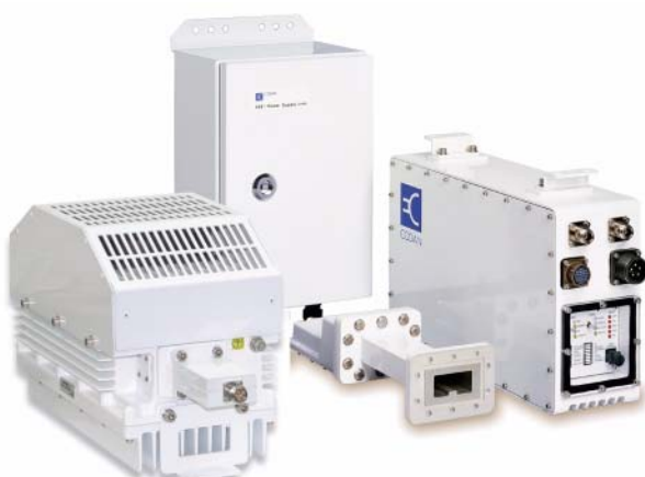
C-Band transceiver 5700 series with optional power supply unit

RF modules are fully sealed and pressure tested to 34 kPa (5 psi). Particle and moisture penetration is rated to IP68 and the units are submersible to 3 metres.