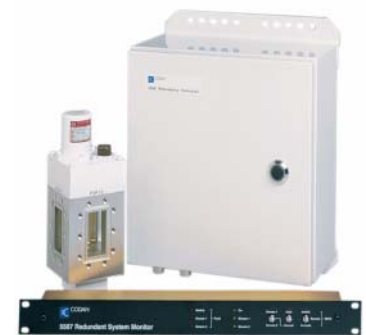
Redundancy Switching System