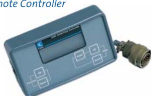
5560 Hand-held Controller

Equipment descriptions and specifications are subject to change without notice or obligation