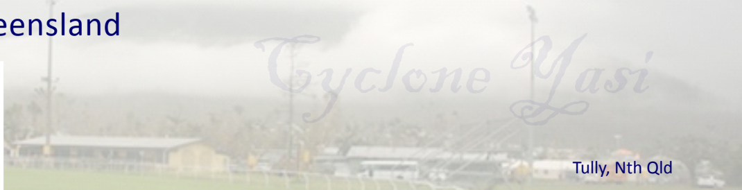
Tully, Nth Qld

9th February 2011, Adelaide: Australian Satellite Communications (ASC) has rushed its disaster recovery solution, ReadyCONNECT™ to cyclone-ravaged Queensland to provide emergency phone and internet communications in the wake of Cyclone Yasi.